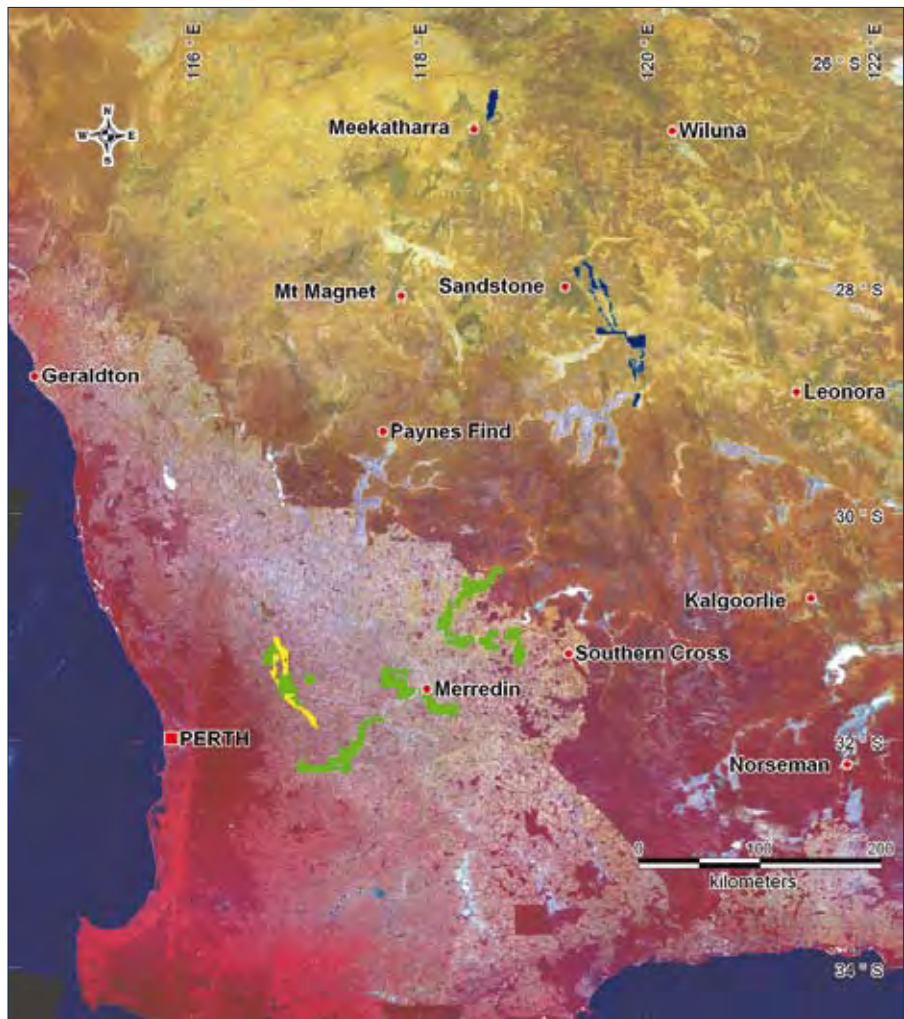
Figure 1 Location of Mindax Projects