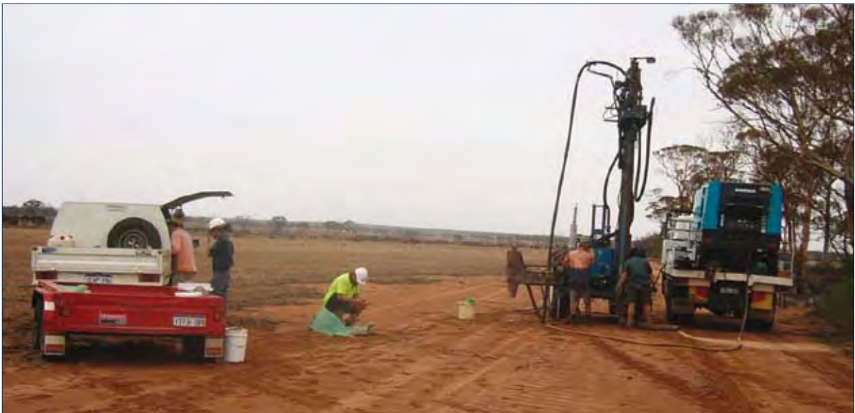
Figure 6 Aircore Drilling near Muckinbudin

The Panhandle gold-copper uranium project is located around a Wallaby like intrusive on the Edale fault south of Bulga Downs. Recent gravity geophysics has defined a structural architecture that appears to control relationships between various geochemical targets. Drill testing has not proved encouraging. Uranium in soils on the adjacent Lake Barlee is still to be resolved and extensive copper mineralisation is known in the north of the lease which has seen some exploration but requires further investigation.