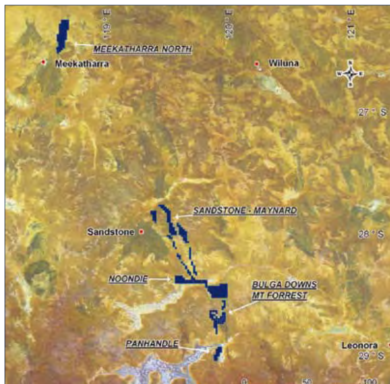
Figure 3 Sandstone and Meekatharra Projects