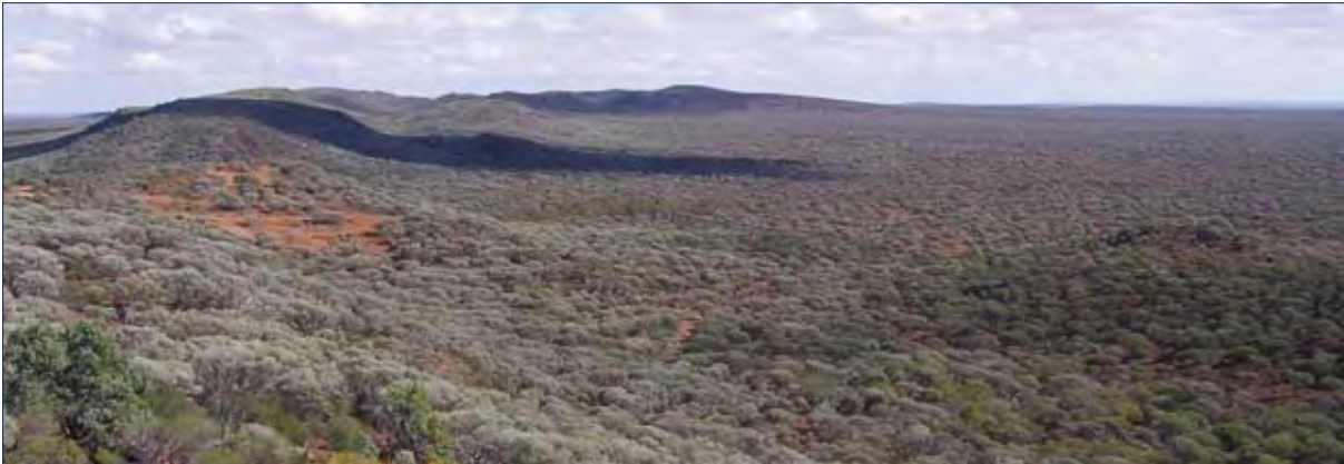
Figure 2 Looking south along the iron formation towards Mt Forrest