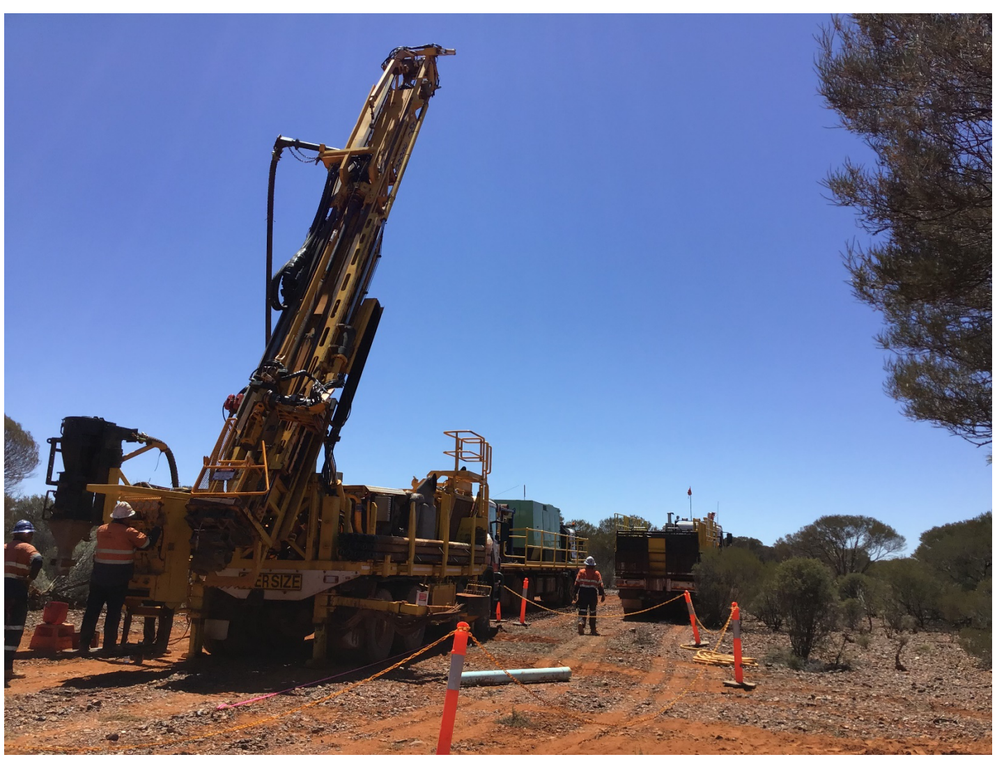
Figure 1: Drilling underway at Mt Lucky